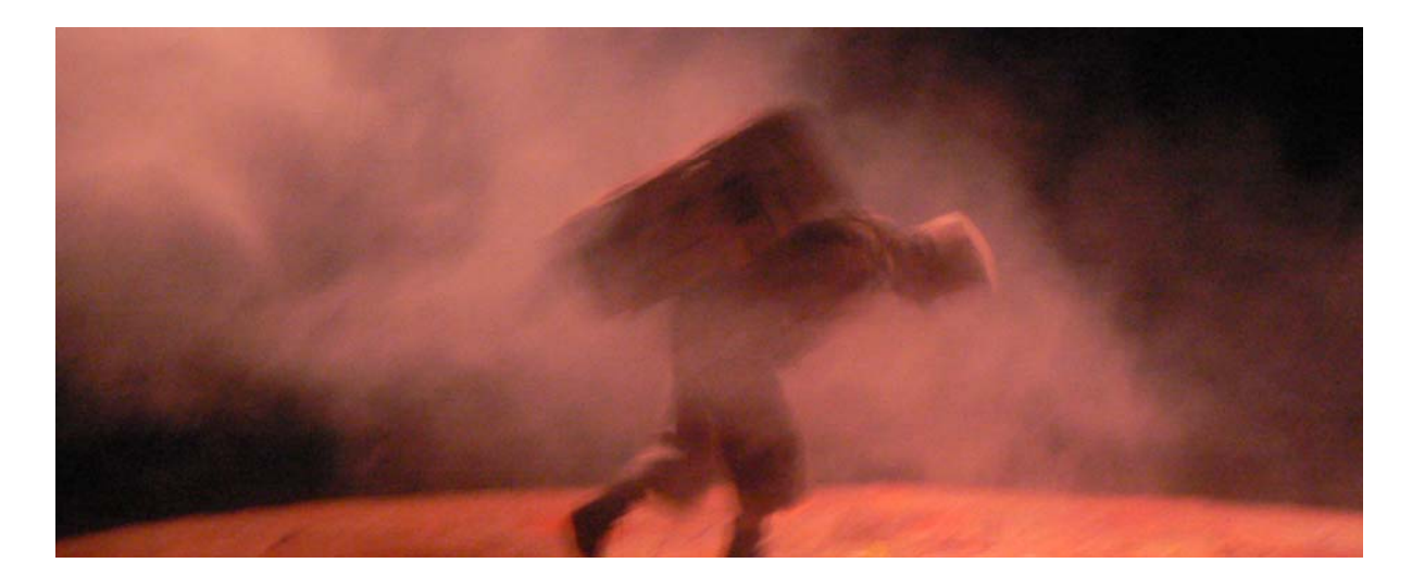
... and that's how a scrap of paper gave birth to a new world!

In the middle of nowhere, a man. He walks, alone, tired, having for only company a large suitcase and a big piece of paper.